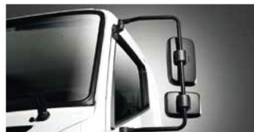
Long stay mirror

The center fascia includes a nicely sized console for storage convenience.