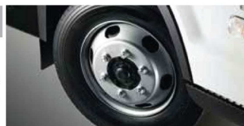
Alloy wheels Mighty looks even more handsome and stylish with the optional lightweight alloy wheels.