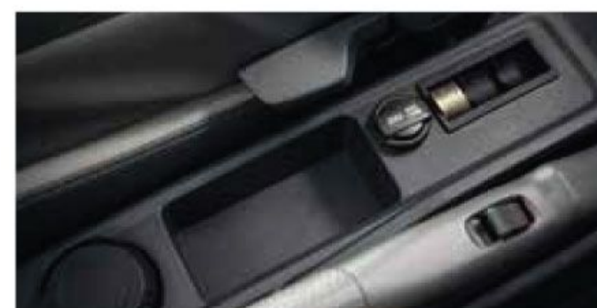
Parking console This console features a storage bin and cupholder for the driver's convenience.