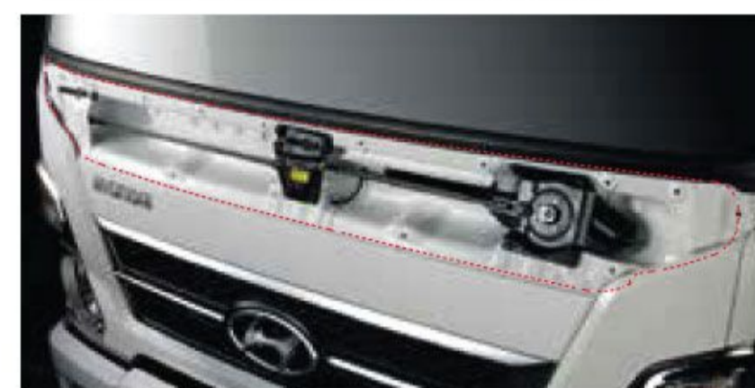
Detachable upper front panel The detachable design allows for quick inspections and easier servicing.