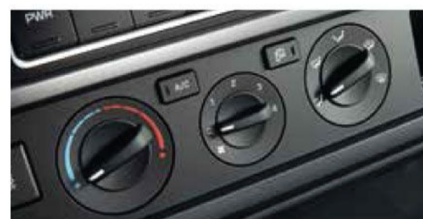
Passenger air conditioning Controls are positioned centrally between the driver and front passenger for the maximum convenience of both.