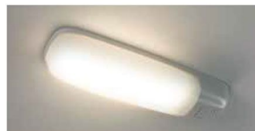
Room lamp The large room lamp provides excellent coverage throughout the cabin.