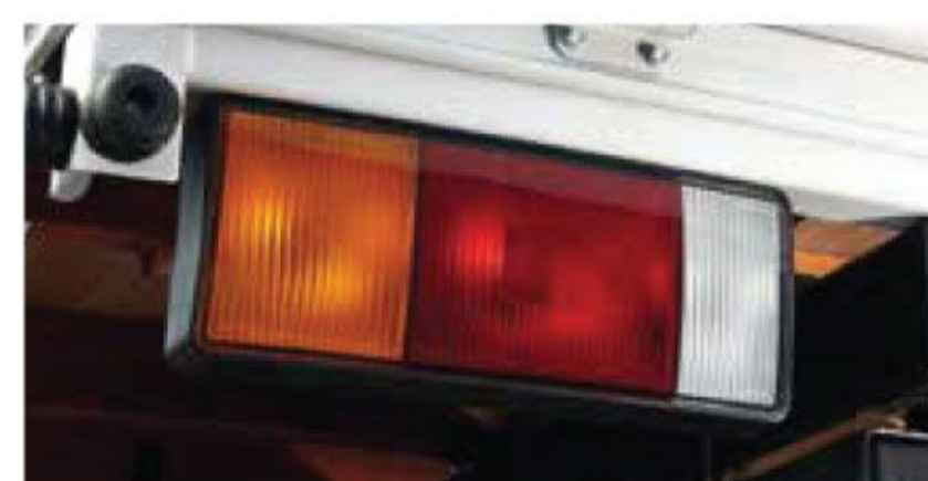
Rear lamps Large rear lamps provide excellent illumination and are easy to service.