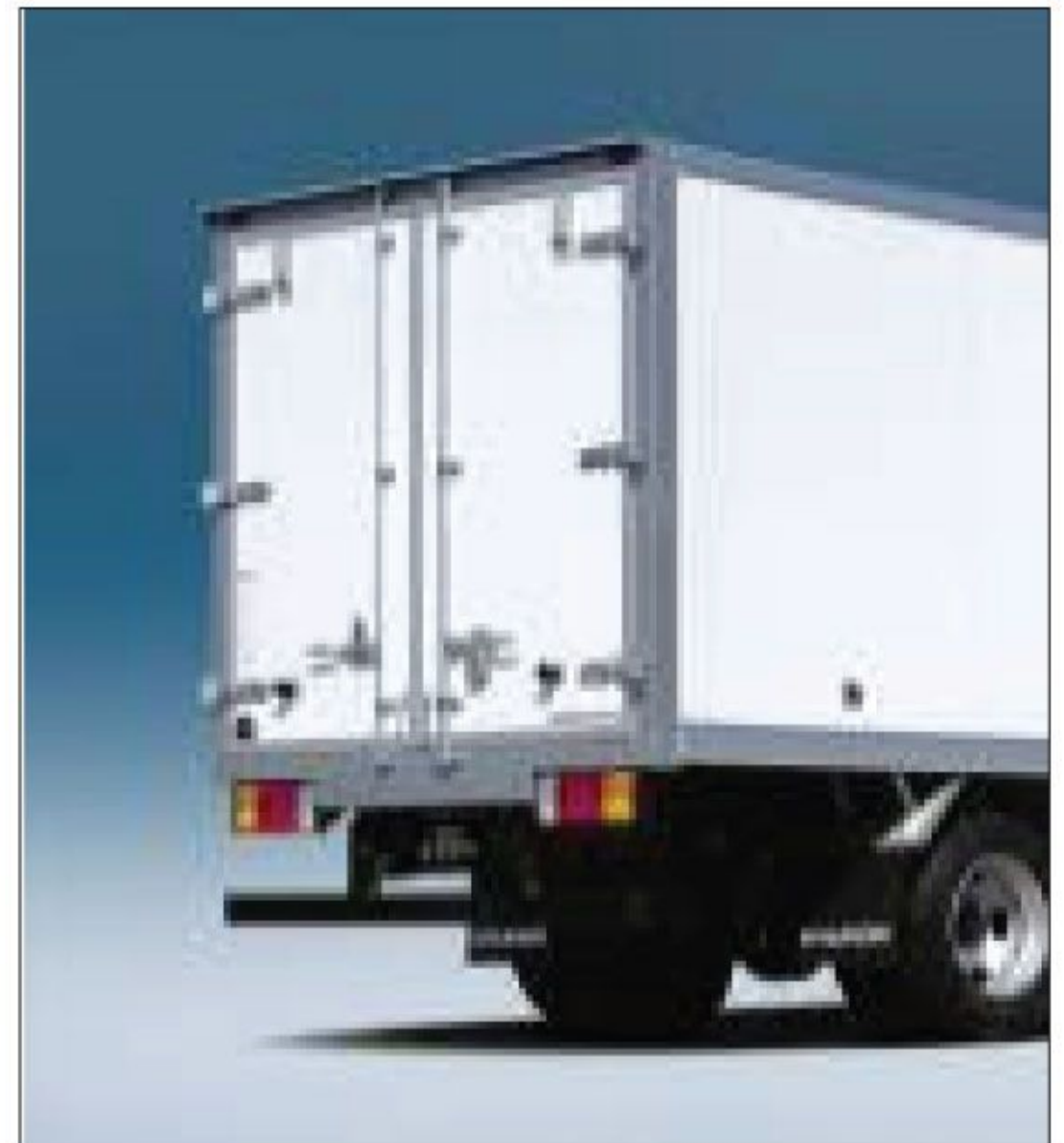
Rear Swing Door