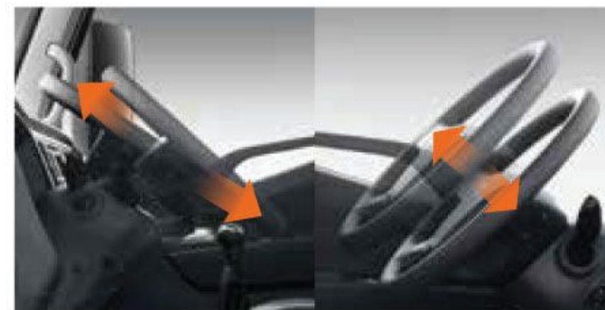
Adjustable steering wheel

The tilt angle and distance can be easily adjusted to ensure the perfect driving position.